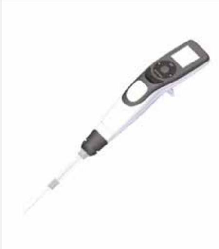
Fig. 1 The innovative eSyringe is part of the scope of delivery of the QuickCODlab and allows the exact dosage of different sample volumes.

The QuickCODlab ensures a high operational reliability and is easy to use. The measured values are output directly to a standard computer and can be quickly and easily processed. The COD measurement is available in just a few minutes.