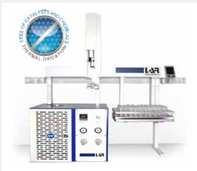
With the extension AutoSampler (Option) the QuickCODlab is able to analyse series of up to 60 samples automatically.

The QuickCODlab easily masters salt concentrations of up to 10 g/l, and even up to 300 g/l of sodium chloride (NaCl) with the additional high salt option. The salts move through the oven, are taken from the system with the condensate and are then collected as solids in a special retaining device. This means that no salt residues can form in the oven and the sample does not have to be diluted, even at the highest salt concentrations. This, in turn, has a positive effect on the accuracy of the measurements.