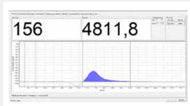
Fig. 3 View of a measuring curve.

The software is very easy to use by means of tabs. It includes an extensive selection of measuring ranges, as well as calibration and parameter settings, which permit a quick and accurate analysis of the sample. The measurement series, which can be exported for further processing, are automatically evaluated, internally stored and displayed in the form of data tables and measuring curves (Fig. 3).